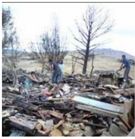
People shift through the remains Tuesday of the Ridgecrest Drive fire that destroyed six homes.

Investigators today are continuing to look into the cause of the 2:42 p.m. fire that started in a brush area at the base of the hillside below the homes and caused an estimated $2 million in damages. Investigators also